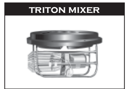
The Triton Mixer is available in both a floating and subsurface configuration depending on your water quality management needs or aesthetic preferences.

Triton Mixer comes as a complete package unit, pcc and cable (60Hz). When deciding upon the floating or subsurface mixer, please note that in cases where there is an excessive amount of sludge or debris build up on the pond bottom, we recommend that you opt for the floating mixer (Triton vs. Sub-Triton), as you may run into the risk of the Sub-Triton sinking into the floor of the pond or lake. For more information on whether this might be a concern for you, please contact Otterbine or your local distributor for an on-site inspection.