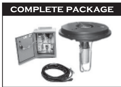
U.S. Package: Unit, NEMA 3R Power Panel (with timer, GFCI (except 460V), breaker, surge arrester, HOA switch and thermal overload protection), 50 ft. of SOOW cable. Int'l Package: Unit and 15m of cable (no cable on CE).