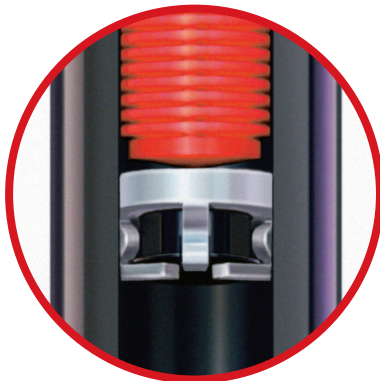
Patented X-Flow® Shut-off Device

Up to 40 gallons of water per minute can escape through a spray head that has a missing or damaged nozzle. This wasted water can lead to landscape erosion, property damage, or unsafe conditions due to wet hardscapes. The patented X-Flow device is factory-installed in the riser and holds back over 99% of the water that would otherwise be wasted in cases where the nozzle has been compromised through unintentional accidents or vandalism. Furthermore, X-Flow Technology allows for spray head maintenance or component replacement without the need to turn off the system.