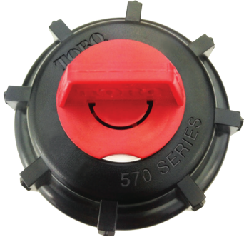
570Z & 570ZLP