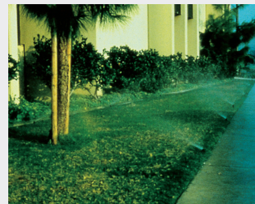
With Pressure Regulation