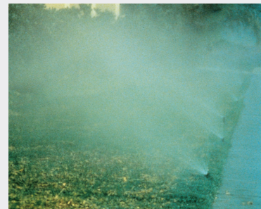
Without Pressure Regulation